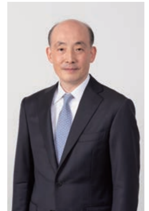
President, Kuraray Co., Ltd.